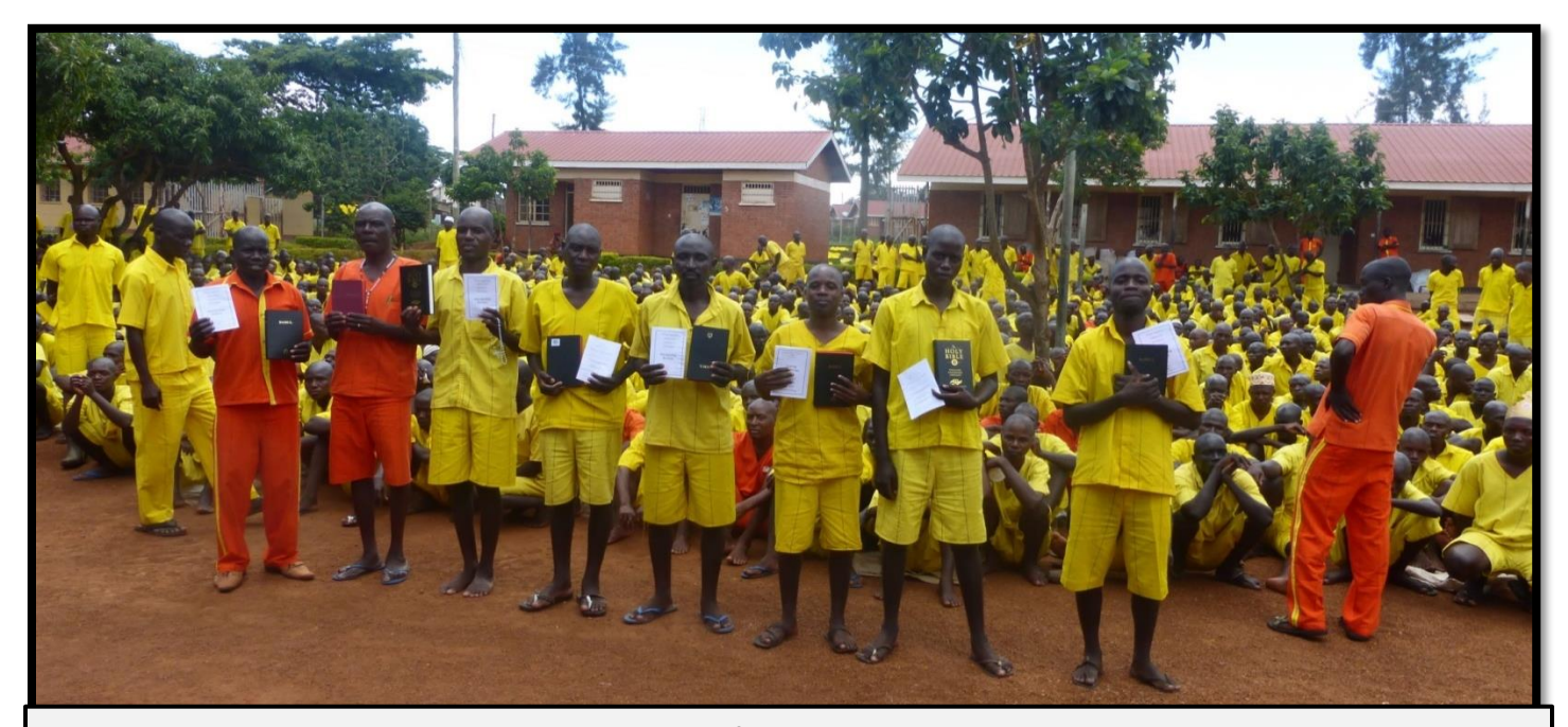
Masindi Prison, one of 17 prison crusades in Uganda

my strength is made perfect in weakness," had never been more prevalent in my life than during this time. We did not cancel any crusades but, by God's grace, added some instead. Because of His strength, I was able to preach two to three crusades a day, ministering in a total of five Kenyan and seventeen Ugandan prisons, in addition to nine village/church crusades and two conferences.