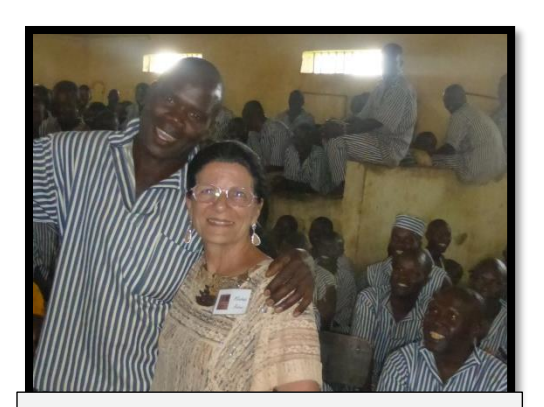
He asked his peers to forgive him

This year we watched the Holy Spirit bring thousands to salvation with thousands more making decisions to forgive themselves or someone else. After hearing the forgiveness portion of the crusade, one prisoner shared that he had started fights and arguments with many of the 1,200 other inmates but that day he received Christ