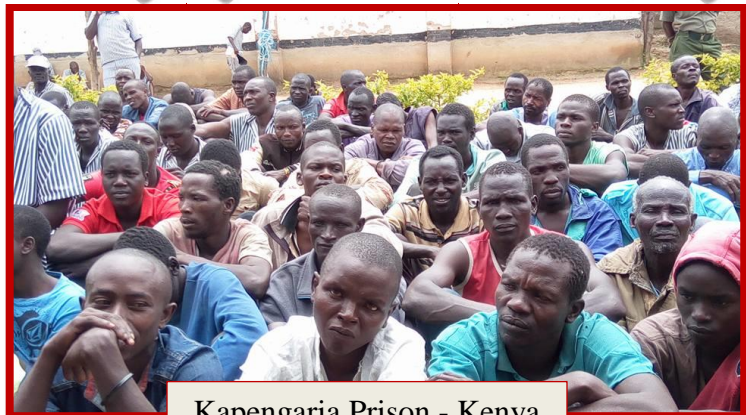
Kapengaria Prison - Kenya

“For God so loved the world, that he gave his only Son, that whoever believes in him should not perish but have eternal life. For God did not send his Son into the world to condemn the world, but in order that the world might be saved through him.” John 3:16-17